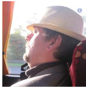
Some were exhausted...