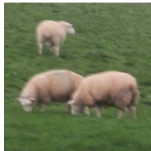
...while others didn't care at all !!