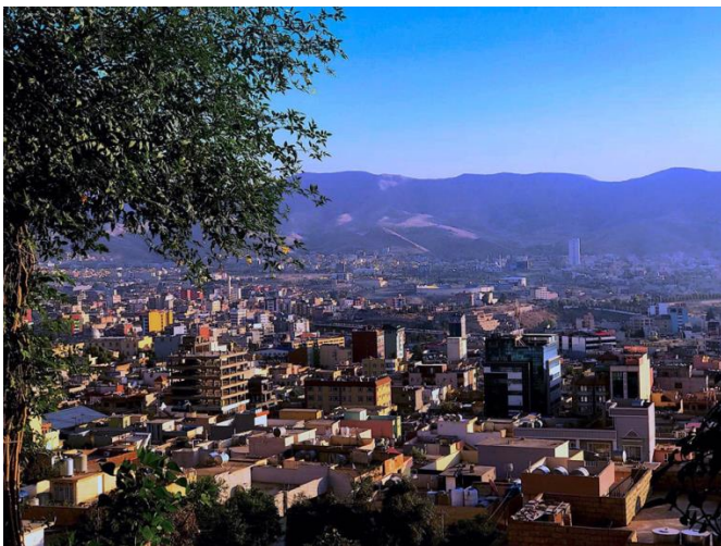
Figure 5: View pf Duhok City with Zawa Mountain in the background.

UoD, in collaboration with the Duhok Directorate of the Environment, are planning to establish two Eco-garden projects: one at Zawa Mountain and one at Zawita Forest. Duhok city is surrounded by several mountain ranges. One of the best and most accessible sites to view the city is from Zawa Mountain (Figure 5), one of the city's defining features and, despite its lack of development, a top tourist attraction. Over the last decade, Zawa hilltops and slopes have experienced consistent deforestation resulting in a grassland rocky landscape with low density of shrub cover and now largely devoid of trees. Therefore, a large-scale reforestation of trees and shrubs can both increase the potential recreational opportunities for Duhok city and at the same time ecologically conserves the mountain. It will generate income and create employment opportunities for local people and camps residents (IDPs and refugee) during the establishing phases.