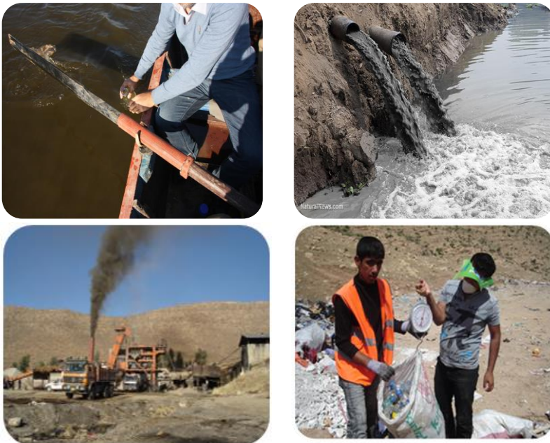
Figure 4: Environmental monitoring activities around Duhok. Top left: water quality for drinking water samples from Duhok city for analysis. Top right: wastewater monitoring and sampling for analysis. Bottom left: monitoring of air pollution. Bottom right: solid waste monitoring for management and treatment.

Urban areas suffer from unhealthy air quality and impacts to land due to practices that both the government and the public are adopting such as: unregulated use of fossil fuel power generators (due to the insufficient output of electricity generated by the government), lack of car emission regulations and modern car inspection techniques, trash (due to inadequate trash collection) and tire burning (in social and ethnic celebrations), and lack of green belts and parks in and around urban areas.