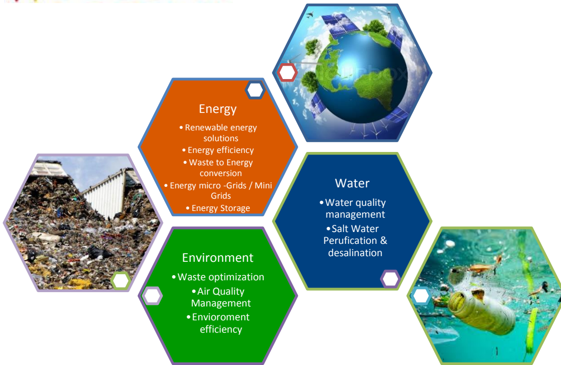
Figure 1: University of Johannesburg Process, Energy & Environmental Technology Station (PEETS) Focus areas.