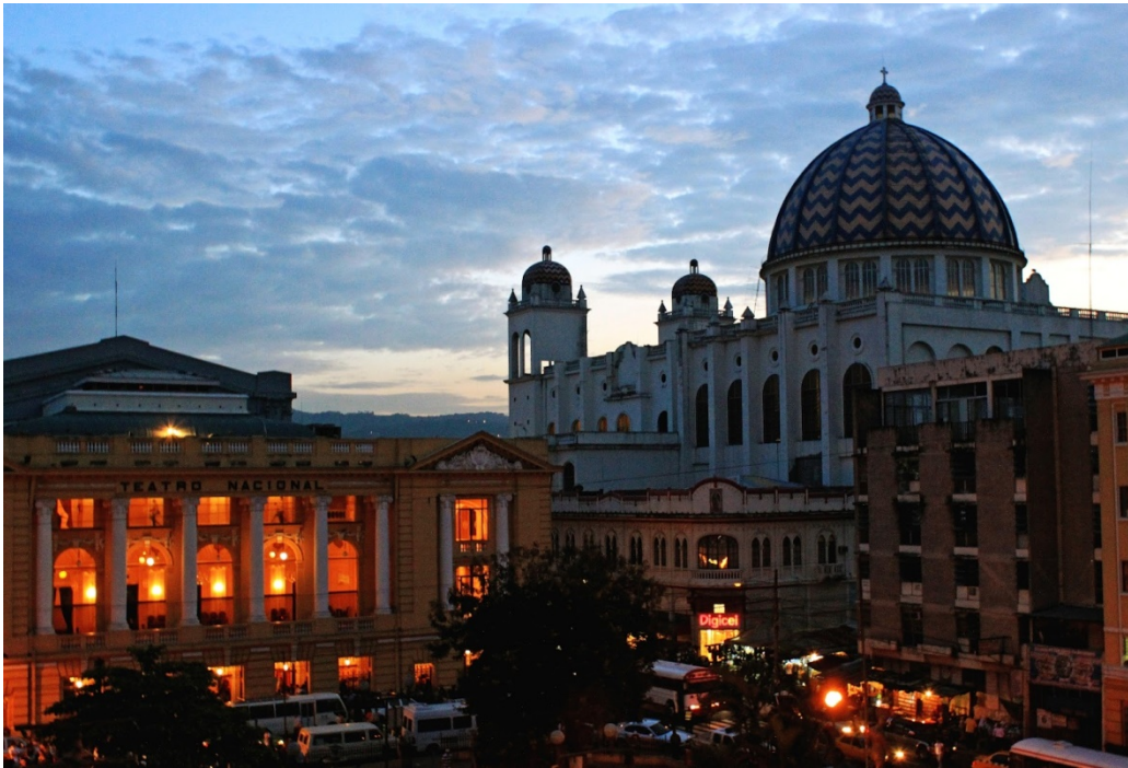
6. Image: http://marketingsimulator.net/hvalladares/

Joseph Conrad's Nostromo , constitutes a heartbreaking prophecy of Latin American fate and a portrait at large of the human character and the struggle between material interests and moral values, following the continued failures of emerging societies to unleash themselves from a self-perpetuating scheme of corruption and wealth concentration. His uncompromising portrayal of a failed libertarian effort translates into a modern edition of Sisyphus Myth at a continental scale.