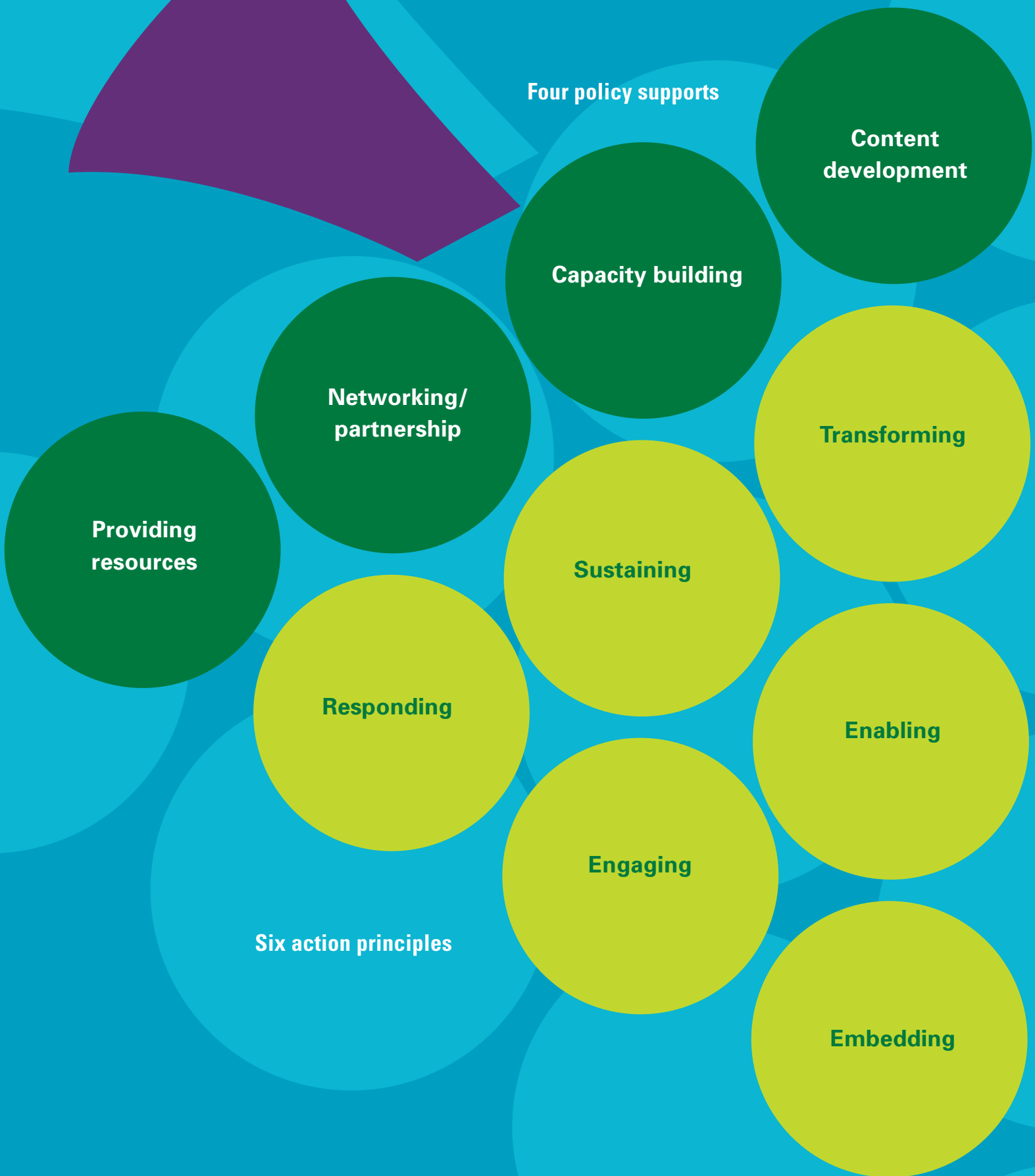
Figure 1: Action principles and support mechanisms