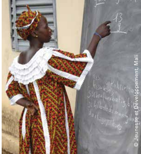
Circle member practicing numeracy

Of the 314 circle members who took literacy assessment, the majority achieved advanced literacy levels (120 women and 41 men). In monetary terms, villagers made substantial profit by producing and selling local soap and dyed clothes and by increasing their maize production.