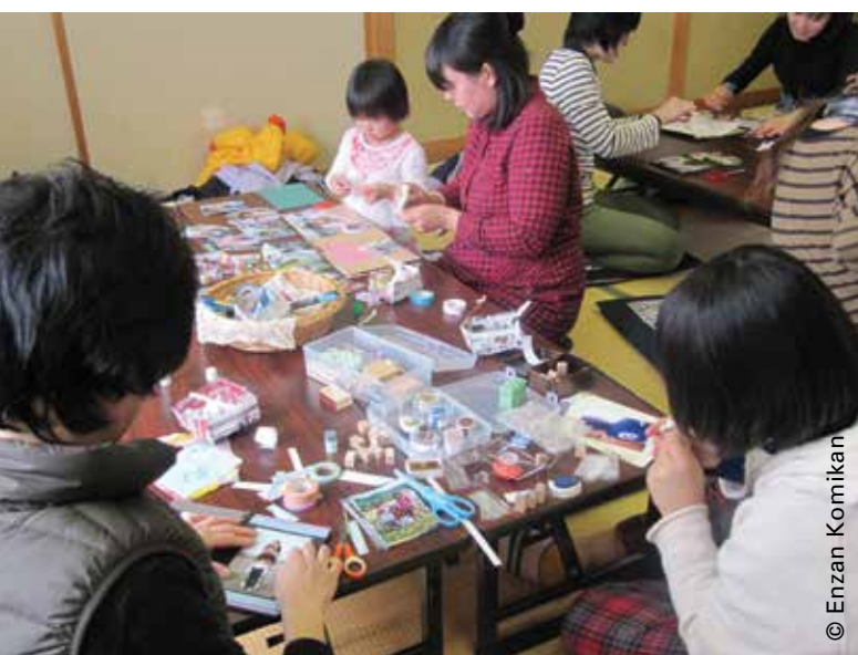
Intergenerational learning activities