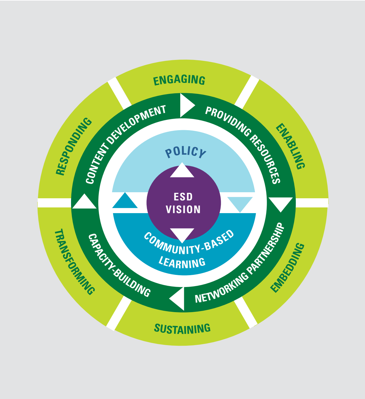
Figure 3: Six action principles and four policy support mechanisms

To complete the picture, the Okayama Commitment clearly outlines that the six interrelated action principles require ongoing support in order to achieve the long-term vision of ESD, which can be provided through policy mechanisms. Each of the ESD practice case studies have identified specific policy support mechanisms that contributed to their successes.