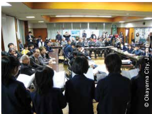
Children presenting their wishes for a clean environment during the Kyoyama ESD Festival