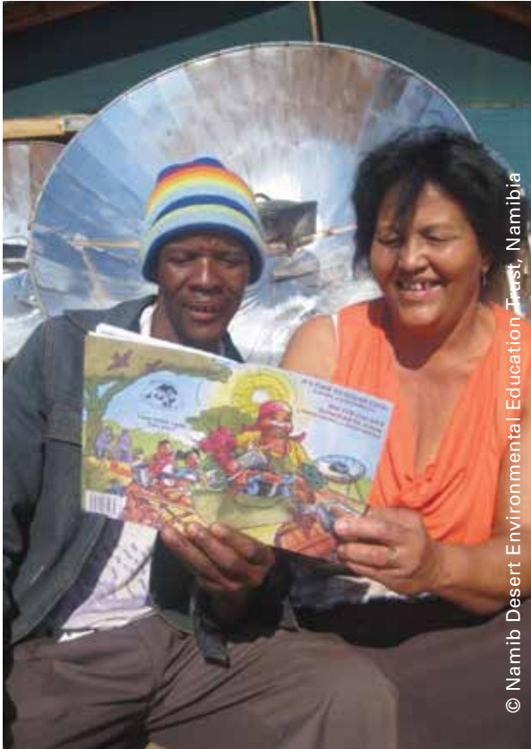
Adults enjoy reading an educational book