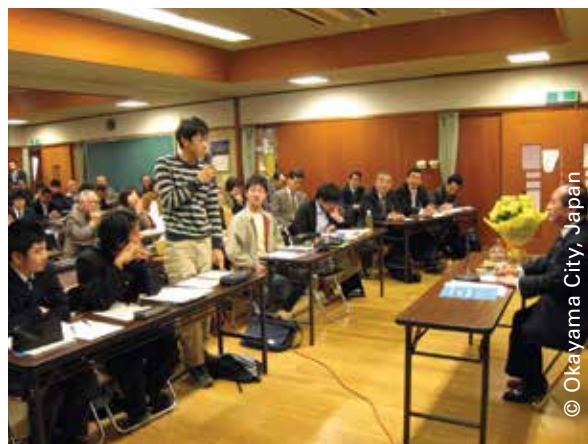
High school student participant conveying KEEP recommendations to city mayor

the planning, implementing and reporting of each activity. Older children and adults from schools, universities, IT companies, local government and media were also involved and provided the necessary technical and logistical support.