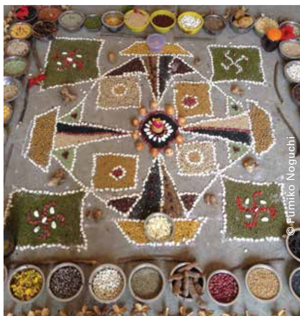
Mandala made by a women's group with locally grown agricultural products

Gram Nidhi successfully embedded a more holistic approach to learning within the very specific micro-finance project. Capacities of socially marginalized women were enhanced so that they could design their own eco-enterprise project and carry out their business successfully and sustainably. They were empowered through the project to develop confidence and independence which they had previously lacked.