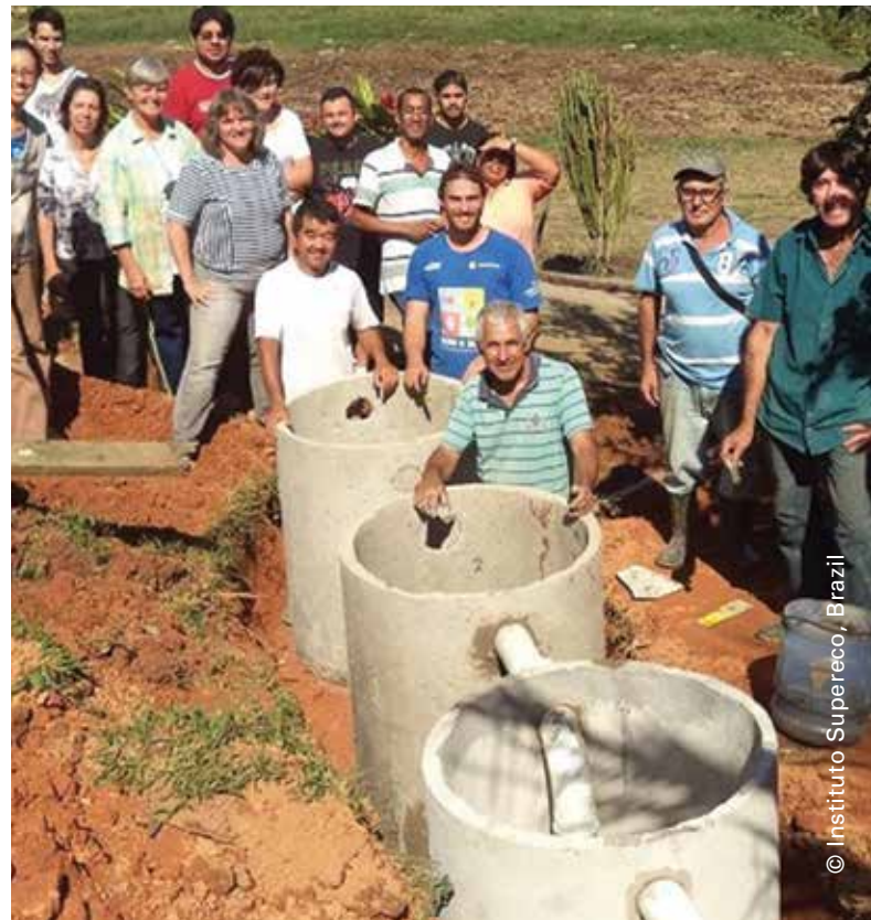
Community working on a biogas plant in Caraguatatuba