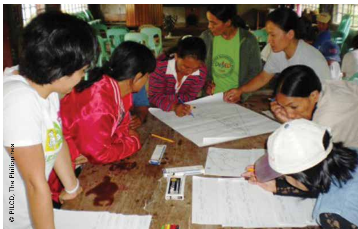
Community members doing hazard mapping