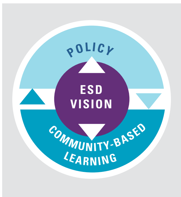
Figure 1: Shared vision

An appreciation of each of these dimensions will help to illustrate the ways in which CLCs and other community organizations can practise the Okayama Commitments 2014, not as individual independent actions, but as holistic and transformative practices. Institutions that have effectively facilitated community-based ESD have demonstrated combinations of these six