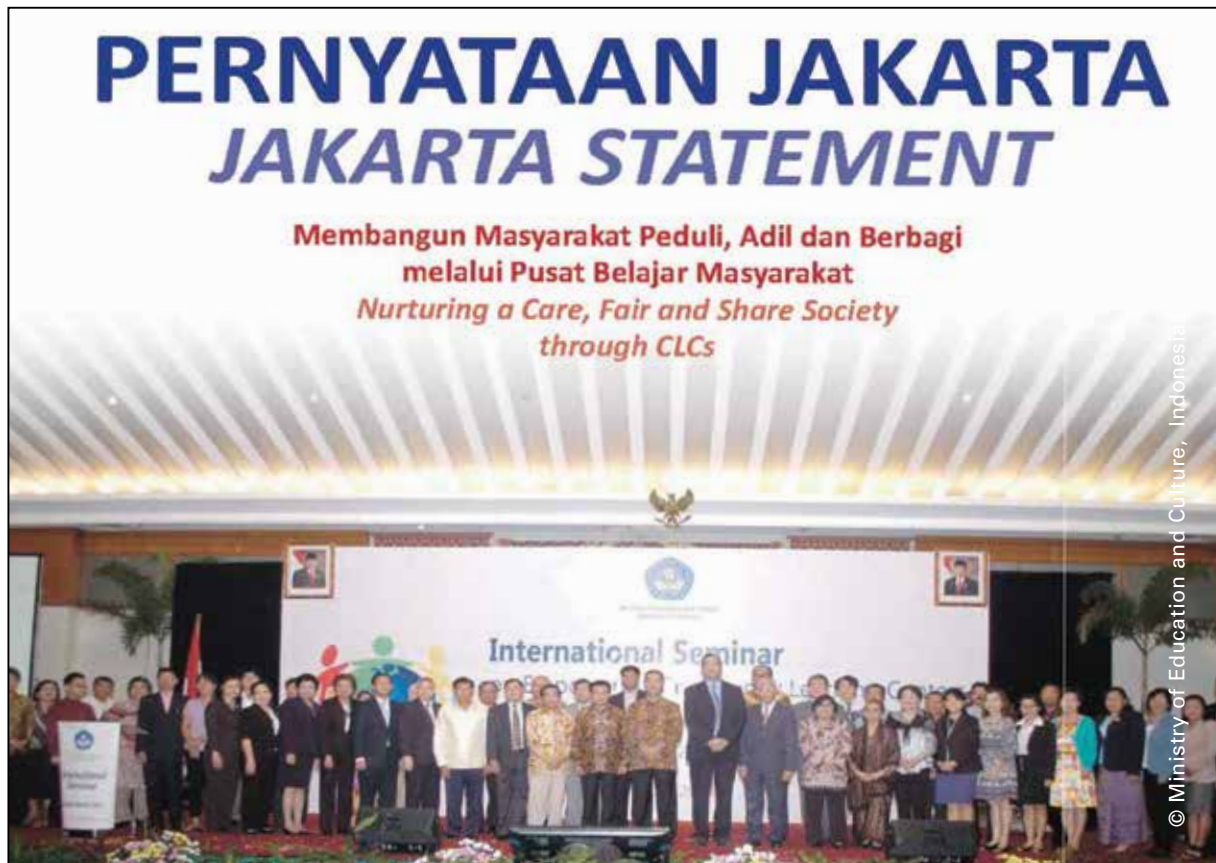
Discussing the process of drafting the Okayama Commitment