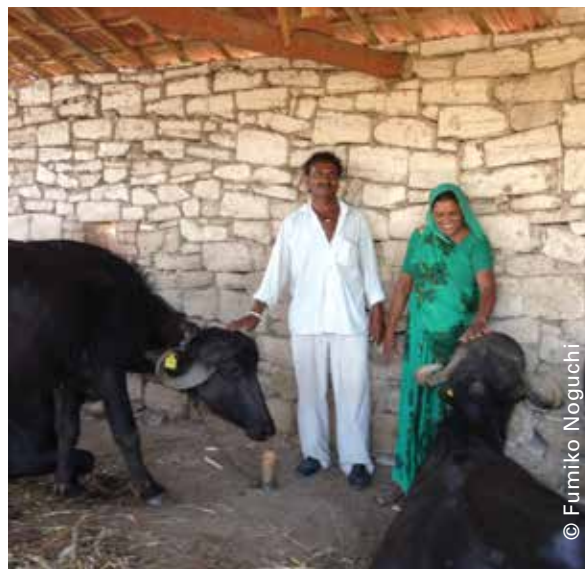
A farmer couple showing their indigenous cows purchased with microfinance credit

Gram Nidhi activities have resulted in positive transformation of the local communities. The socially marginalized people have developed pride in themselves and their communities by re-evaluating local knowledge and re-establishing the community network.